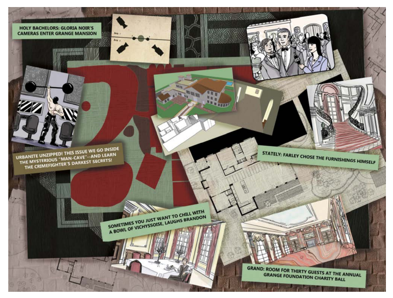
FIG. 3: Mind Map 2. The completed mind map featured in MSCSI Vol. 1, Issue 2, with a narrower focus on Cat's investigation into the inconsistencies of Grange Manor.

The third mind map, featured in Vol. 1, Issue 3, sees Cat conducting a dual investigation into villain Carnival's patterns of behavior and fallen theater star Connie Carmichael's reinvention into the superheroine Sekhmet. Unlike its predecessors, the content of this mind map was spread across four pages interspersed throughout the issue in time with Cat's findings. Carnival's clues are provided in a newspaper article, which Cat mentally annotates, and this serves as the background image of all four pages. Connie's parts of the mind maps are presented as a series of ten images cascading across a newspaper from left to right in chronological order across two pages, illustrated below: