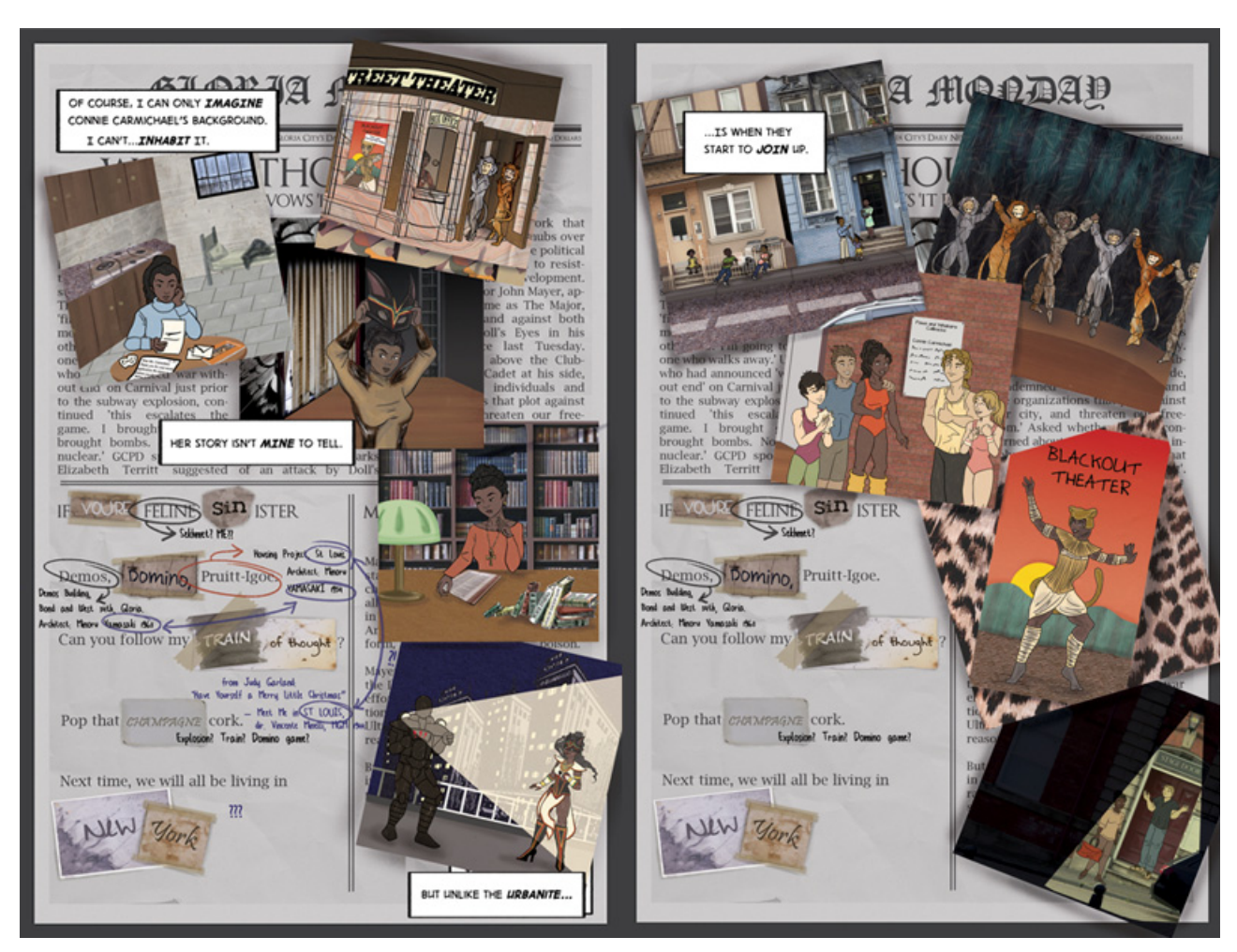
FIG. 4: Mind Map 3. The completed mind map featured in MSCSI Vol. 1, Issue 3, demonstrates the process of Cat putting together information about Sekhmet's history, against the backdrop of a newspaper reporting villain Carnival's recent terrorist attack.