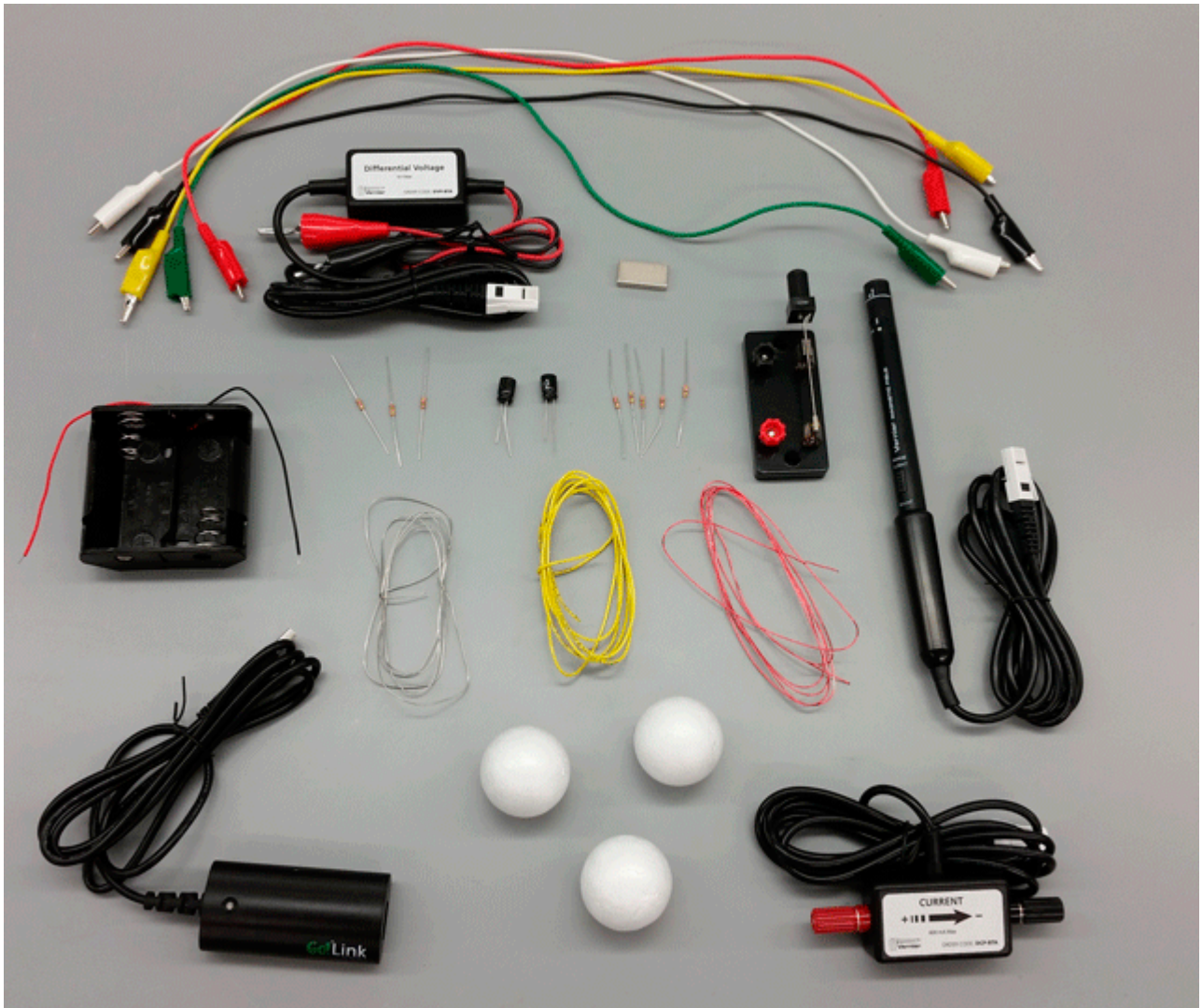
FIG. 2: Contents for one of three introductory physics home-study kits (PHYS 205)

These kits are very popular with students and have resulted in dramatic increases in student enrollments (Kennepohl, 2013). The fact that students valued the increased accessibility and flexibility of working at home was not new or surprising. However, we did run across another big advantage to the home-study laboratory that was totally unexpected. Our studies indicate that home-study laboratories contextualize the learning and also encouraged experiment participation by other household members in the student's home (Kennepohl, 2007).