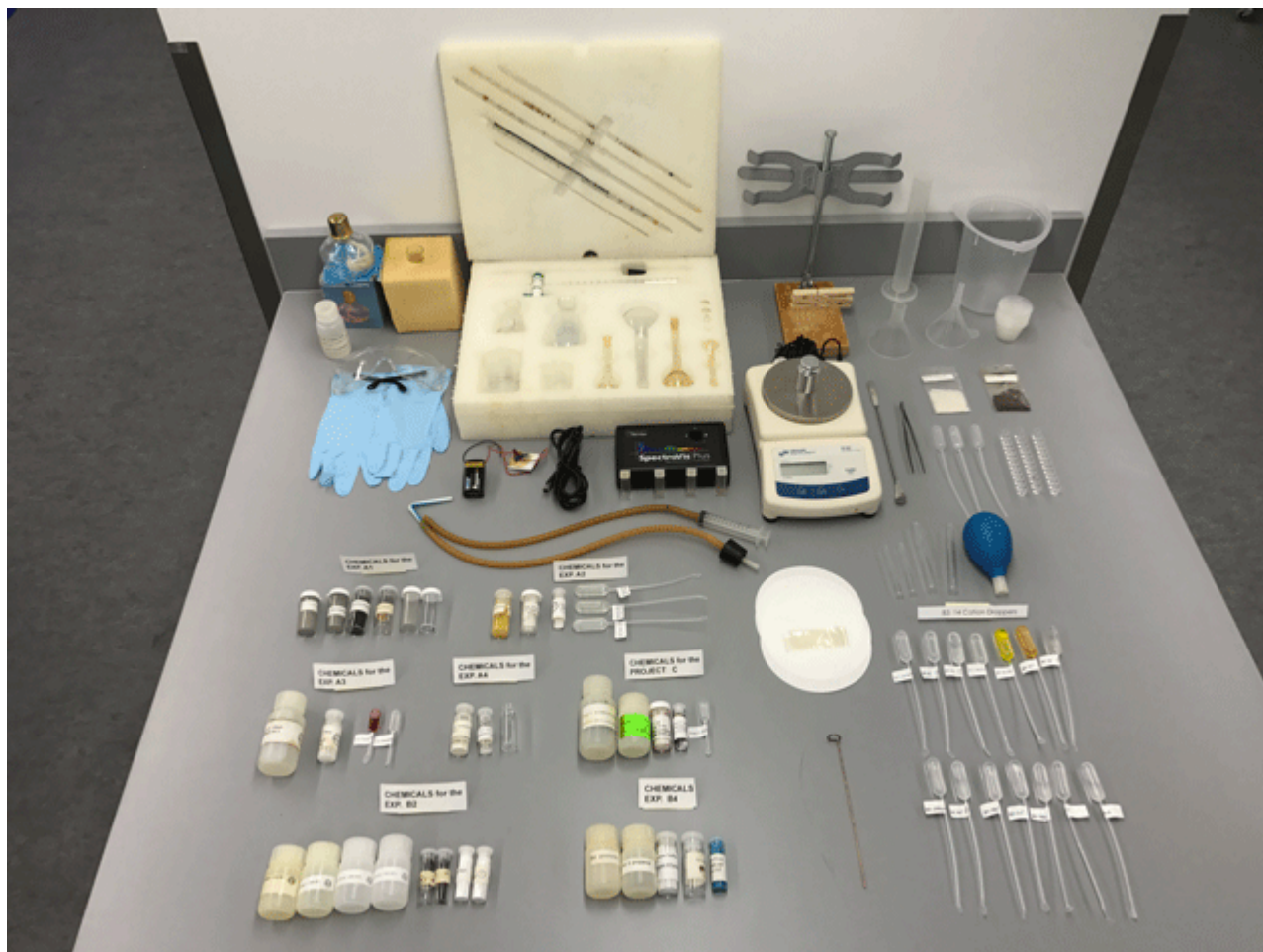
FIG. 1: Components of the first-year general chemistry home-study kit (CHEM 217)

and differential voltage probe via the USB sensor interface Go!Link (all shown in Fig. 2) to their own computer and employ Logger Pro software.